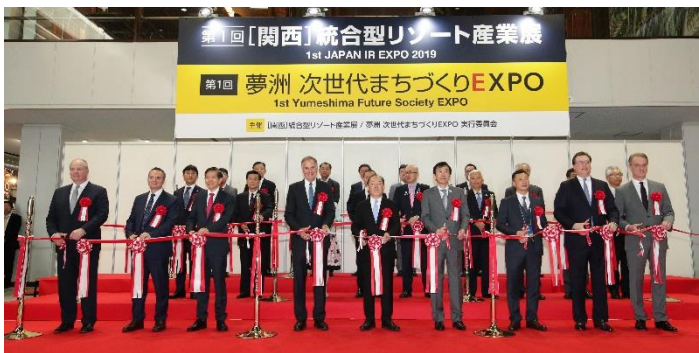
1st JAPAN IR EXPO in Osaka Opening Ceremony (May 15, 2019)